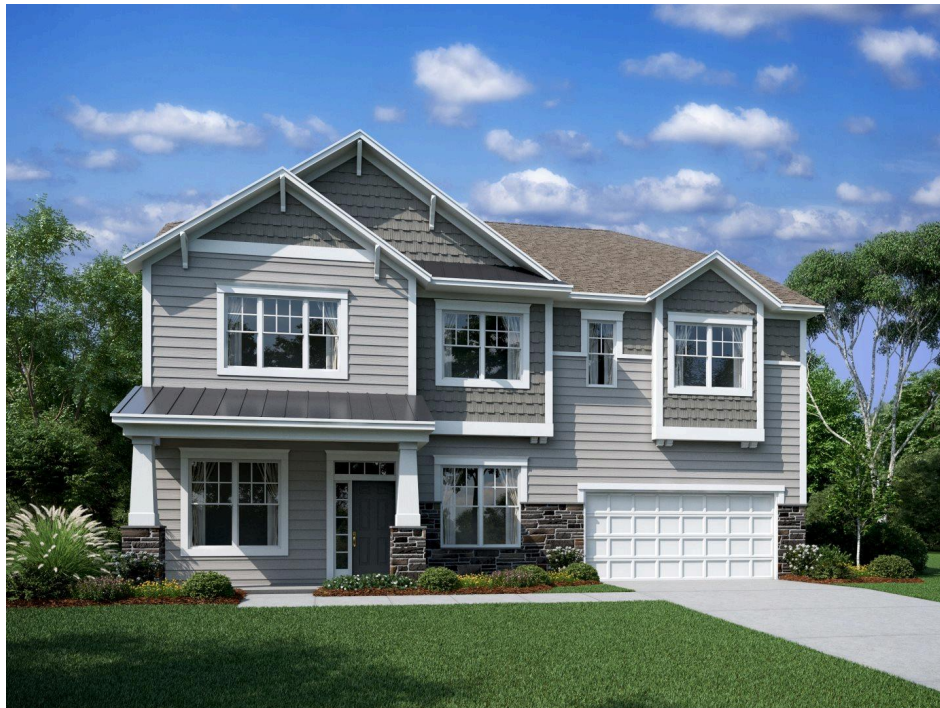
Elevation B Shown with Opt Metal Roof