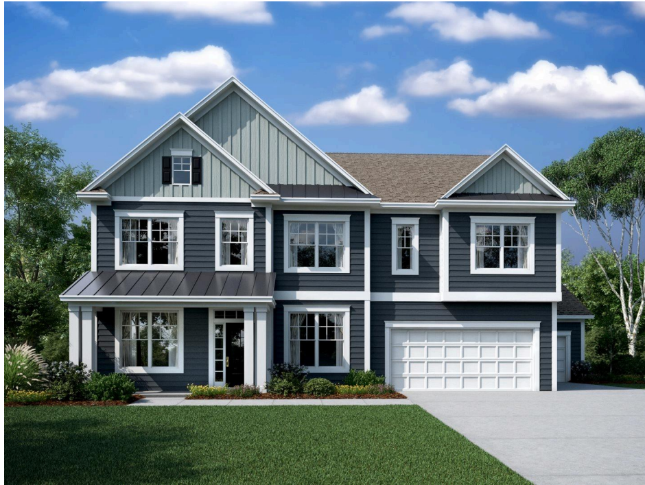
Elevation A Shown with Opt Metal Roof