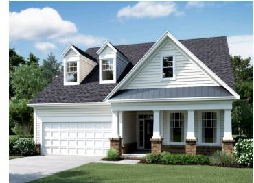
Elevation C Shown w/Opt Metal Roof