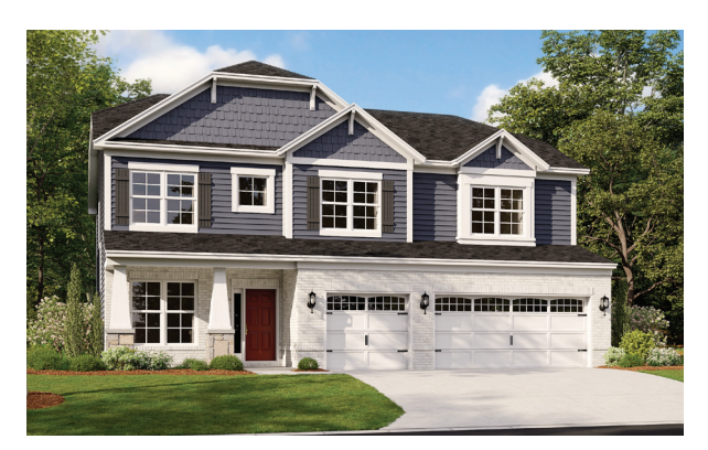
Elevation D - Shown w/ Opt. Brick