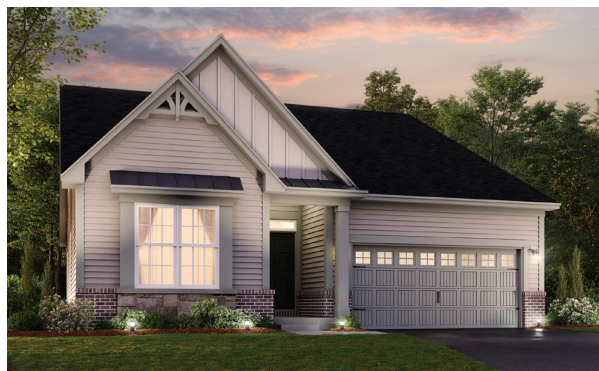
Elevation B - Shown w/ Opt. Metal Roof