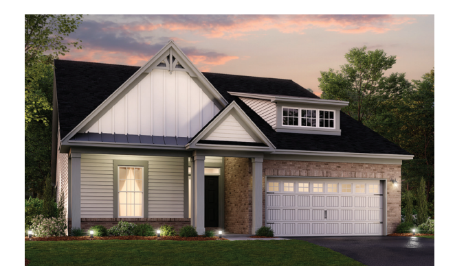
Elevation B - Shown w/ Opt. Metal Roof