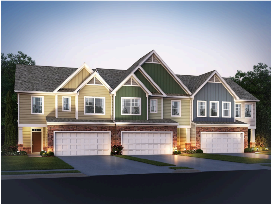
Elevation A,B,C - shown w/Opt Stone, Water Table Masonry and Metal Roof