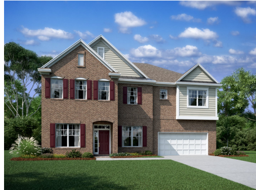
Elevation C Shown with Opt Metal Roof